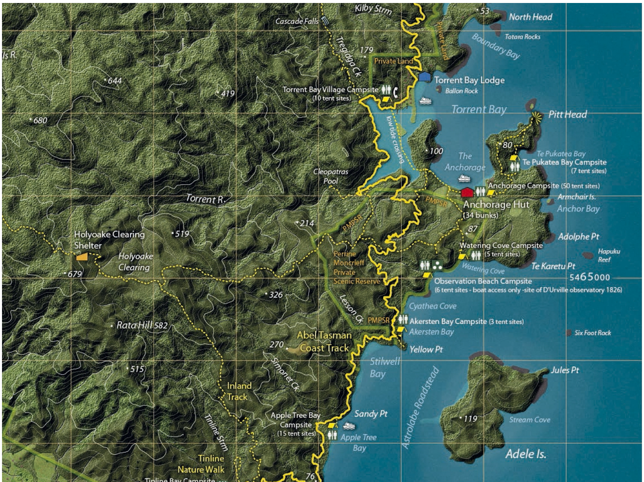
Detail from the Abel Tasman track map