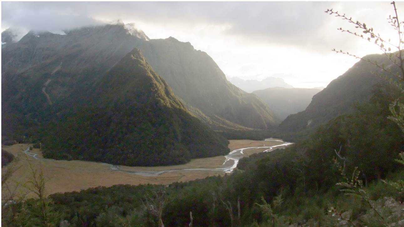
The Routeburn Track, one of the nine New Zealand Great Walks

In mid 2013, Geographx started work on the production of a new series of print maps covering the nine New Zealand Great Walks. This was a significant move for the company as it had never previously produced maps for use in the field. The decision was prompted by confirmation that Government mapping agencies would no longer produce or maintain maps of this genre.