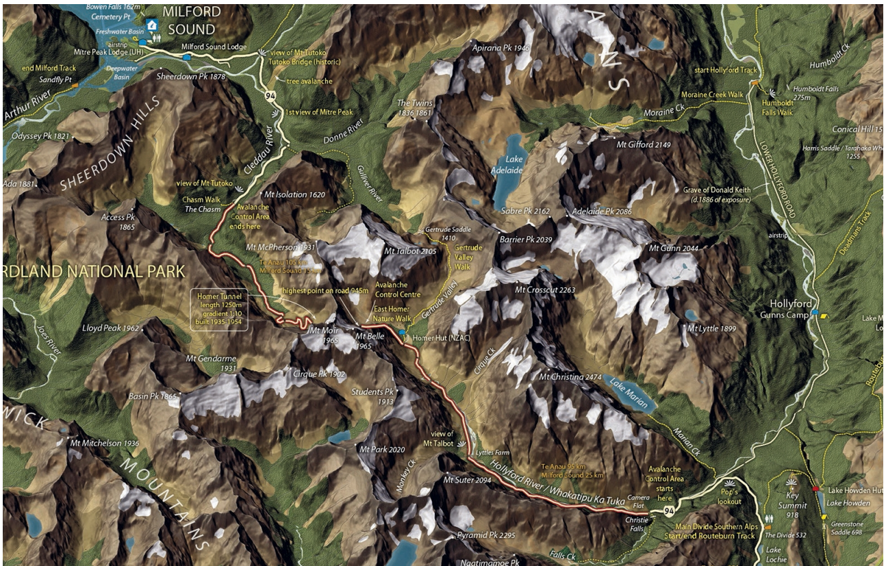
Detail from one of the 3D map posters featured on the reverse side of the track maps.